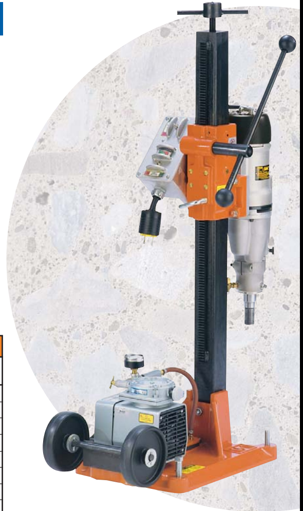
M-1 Complete Combination Rig (20 Amp DeWalt - Part No. 4245055)

* Motor mount (part number 4648004) required if using a WEKA drill motor with M-1 combination or M-1 drill stand.